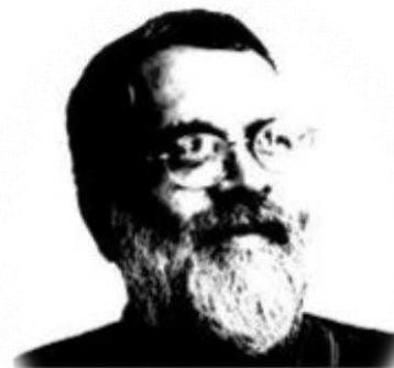
Praful Bidwai Memorial Award